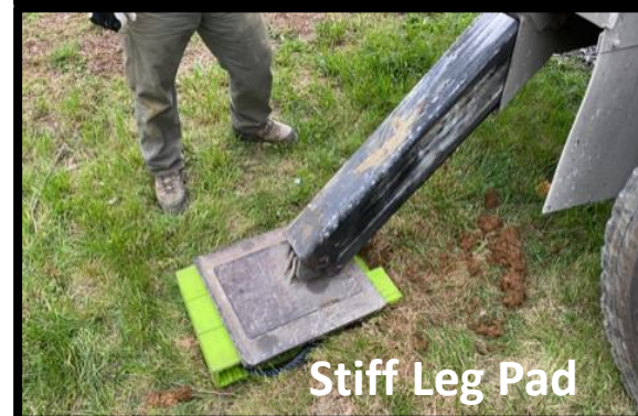
Stiff Leg Pad